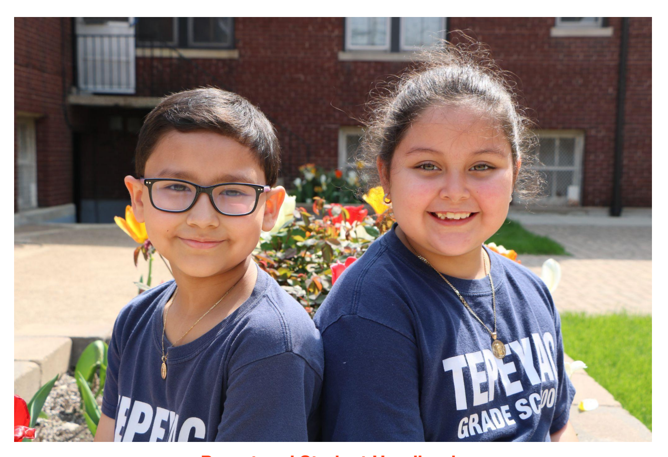
Parent and Student Handbook

Established in 1927, Our Lady of Tepeyac Elementary School was previously named St. Casimir. Our school campus located in the Little Village community of Chicago on Albany Ave and Cermak Road